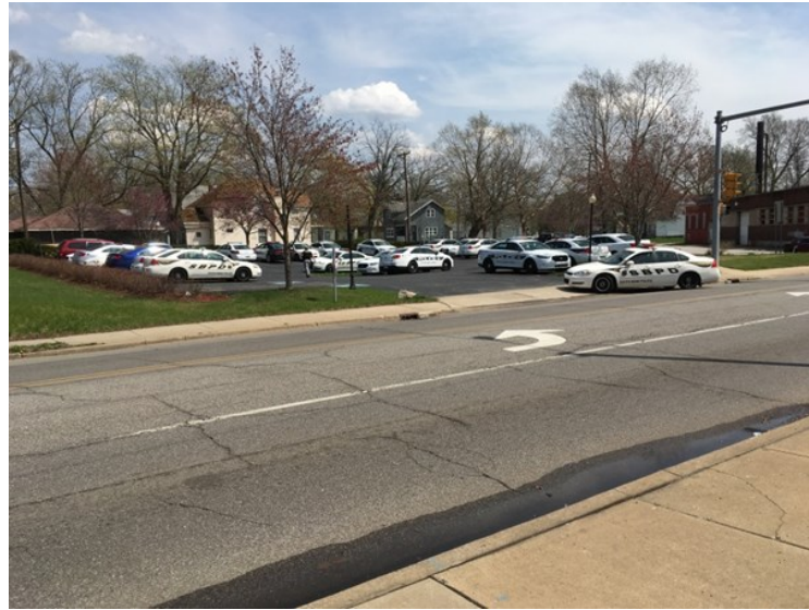
SBPD Units fill the East Parking Lot at the NNN