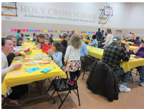
Chilling out, chatting and eating chili! March 29, 2017