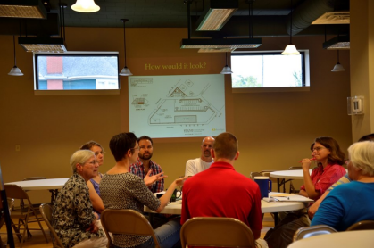
General Meeting regarding Tax Credit Project