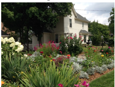
2014 Garden Walk