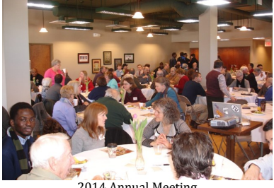
2014 Annual Meeting