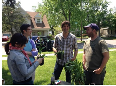
Neighborhood Plant Swap