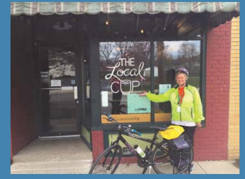
NNN COMMUNITY IN 2015