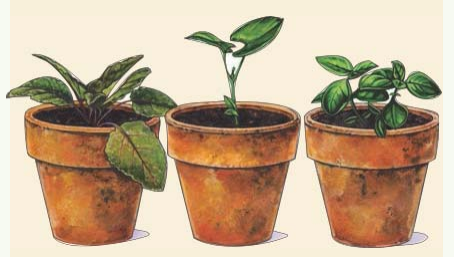
COLLABORATION AND CONVERSATION LEADS TO EMPOWERMENT AND REVITALIZATION