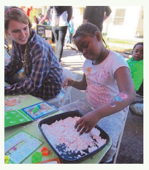
The 2015 NNN Arts Café drew a large crowd of all ages to enjoy the houses, artists, musicians, and the Kid Zone