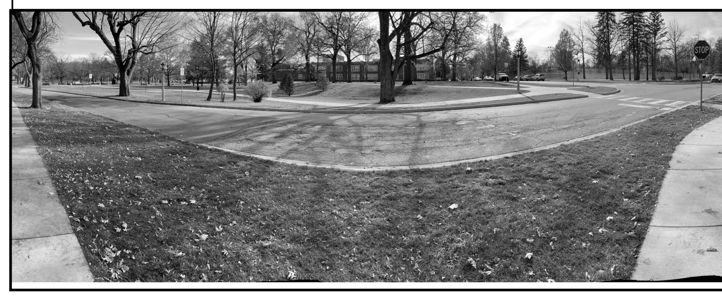
Beautiful Leeper Park, Fall, 2023

NNN's holiday closures are November 23-26 for Thanksgiving and December 22-January 1 for December Holidays! See you in 2024